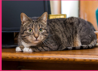
Some changes associated with aging