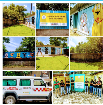
An initiative by Virat Kohli Foundation, Vivaldis Animal Health & Awaaz Voice of Stray Animals Mumbai

The Virat Kohli Foundation & Vivaldis Animal Health inaugurates its Trauma & Rehab centre for stray animals at Madh, Malad in Mumbai. In April 2021, Indian cricket captain, Virat Kohli announced that he is setting up two animal care facilities in Mumbai. Virat, an avid animal lover, credits Anushka Sharma for making him see the difficulties faced by stray animals in our city.